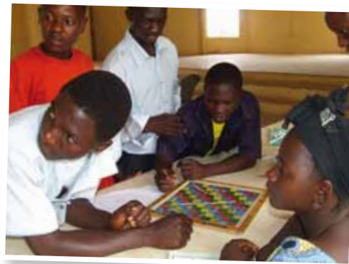
Release's partner the Stefanos Foundation organised a workshop to help young people receive healing for trauma after three communities were brutally attacked by militants in March 2010.