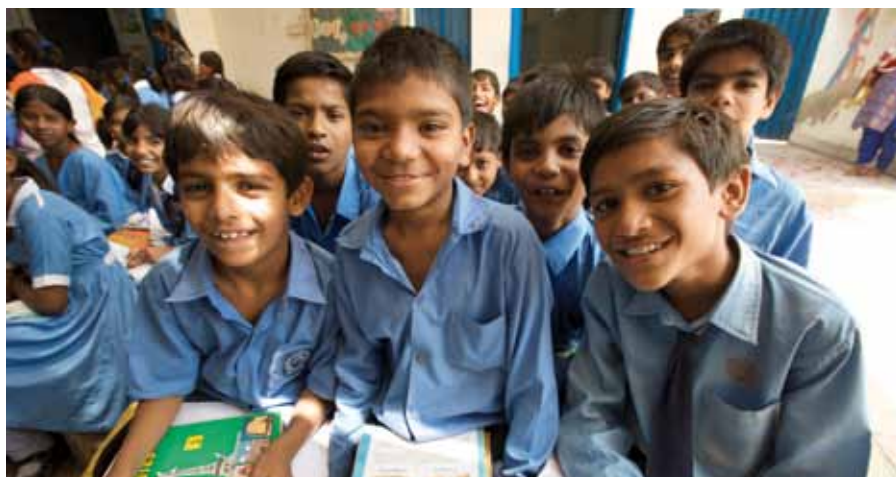
Your support for our campaign has helped 'Let Justice Flow' for Pakistan's Christian community, including these pupils at a Christian school run by one of Release's partners.

In May 2010 we launched our campaign to support persecuted Christians in Pakistan: Let Justice Flow.